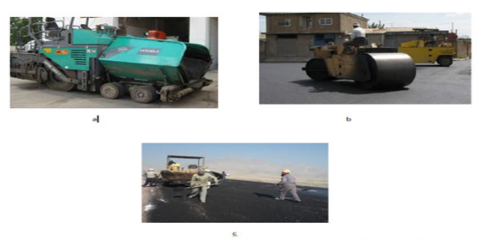
Figure 1 Process of asphalt work: a) finisher machine; b) rubber and steel rollers and c) shovelers

arising from the environmental conditions of the study area was also calculated. For this purpose, the data were collected from a distance where asphalt process did not have any environmental effect. Moreover, WBGT was measured in the radius of asphalt work environmental (WBGT resulting from conditions + WBGT caused by the process of asphalt work). The WBGT difference inside and outside the area of asphalting indicates the extent of WBGT increase caused by asphalt process. For estimation of heat stress, WBGT index was used. In Figure 1, the asphalt process and the relevant equipment has been shown. WBGT was measured at three different time intervals at three heights.