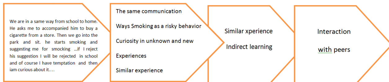
Figure 2 Analysis process

those with low relevance modified category names and content accordingly. Ultimately, researchers and participants reached consensus about meaning of data, categories, contents and meaning units [22].