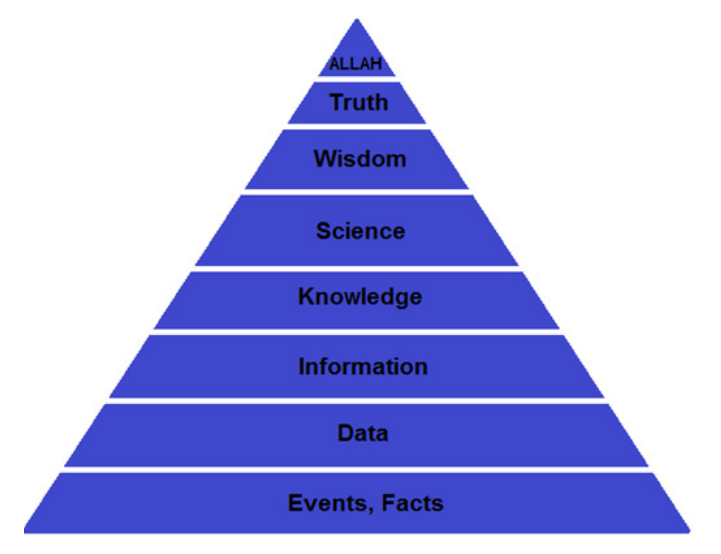
Figure 1 Pyramid of Knowledge (transforming knowledge into wisdom)

there is a consensus about the movement and overall composition of the pyramid [19-20]. Another form of the pyramid of knowledge was drawn (Figure 2) that shows how wisdom is formed [21].