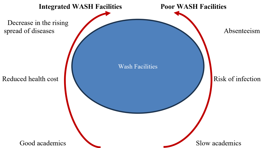
Figure 1. Water, sanitation, and hygiene integration in schools